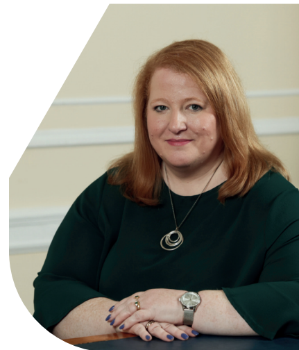
Helen McEntee T.D.

Minister for Justice, Republic of Ireland